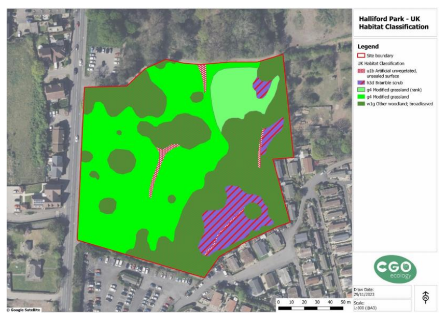
Map 2: Baseline survey of Halliford Park provided by CGO ecology.

Improving the condition of the existing woodland (dark green) could create 2.96 units.