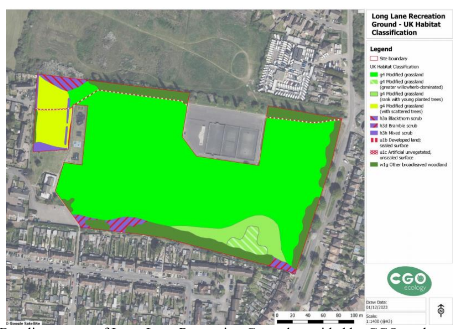
Map 1: Baseline survey of Long Lane Recreation Ground provided by CGO ecology.

An improvement in woodland condition (dark green area around the north, east and south) would create at least two, but likely more, units. A wildflower meadow of 0.6 hectares would create approximately 1 unit. This will be placed at the Southeast of the site.